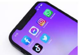
Social Media coverage & Members Interview

Receive discounts on event tickets, CIC services and advertising opportunities.