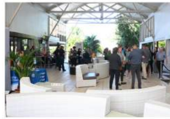
Together Townsville Networks

Receive a copy of the CIC's printed Community Resource Directory and Learning and Recreation Directory. Also available online. Organisations/groups may also be eligible to have a listing in the directories.