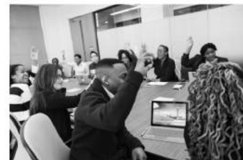
Voting Rights at CIC AGM

The CIC meeting rooms boast a variety of spaces suitable for meetings/events/training. Eligible members will receive a monthly allocation of free uses.