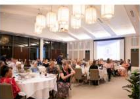
Special Event Invites

Members are invited to attend and vote the CIC Annual General Meeting to help shape the direction of the organisation.